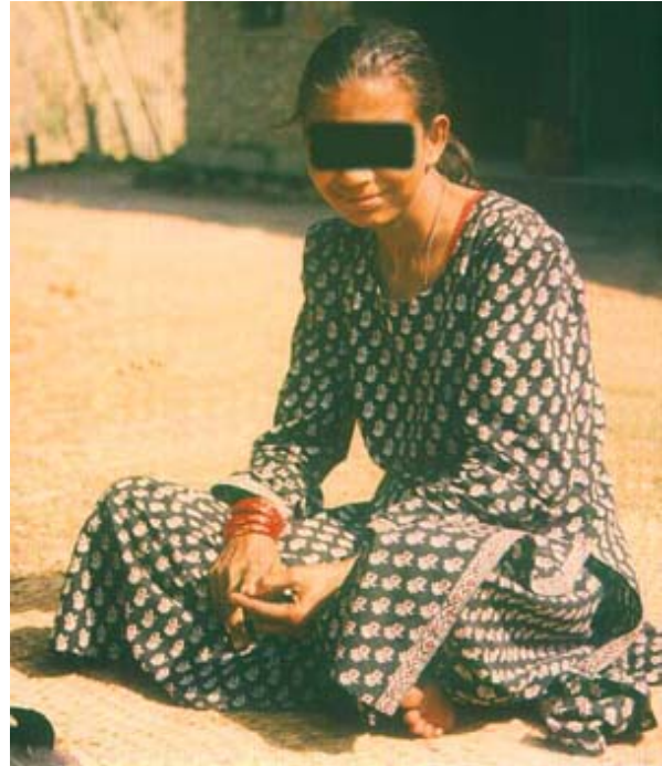
Recently she returned back from Bombay

There are alarming reports indicating that around 500,000 women and children in Asia are sold into prostitution every year and the numbers of victims are on the rise. It is also estimated that the global trafficking industry generates more than five billion USD each year, thus being the third biggest illegal industry after drugs and arms smuggling.