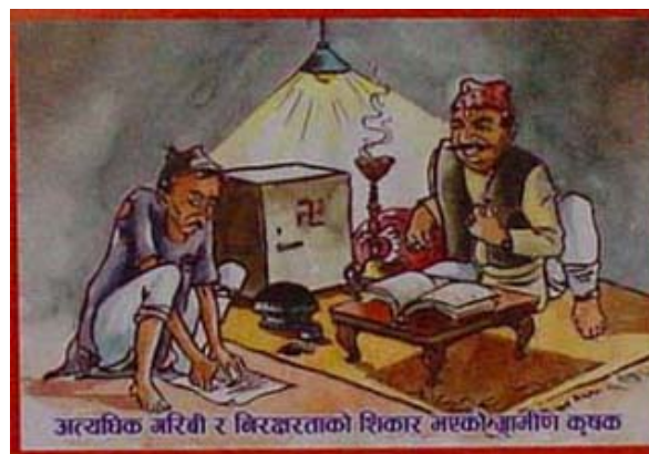
Public awareness campaigns by a local NGO ABC/Nepal including following pictures

and the girls are under constant surveillance. Escape is virtually impossible. Owners use threats and severe beatings to keep inmates in line. In addition, women fear capture by other brothel agents and arrest by the police if they are found on the streets; some of these police are the brothel owner's best clients. Many of the girls and women are brought to India as virgins; many return to Nepal with the HIV virus." ( Human Rights Watch: "Rape for Profit-Trafficking of Nepali Girls and Women to India's Brothels." 1995 )