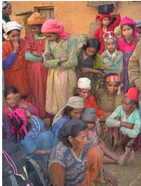
The conflict has left many rural areas devoid of breadwinners, leaving women, children, old and sick people behind.

homes, to escape being recruited by the Maoists or to migrate for work.