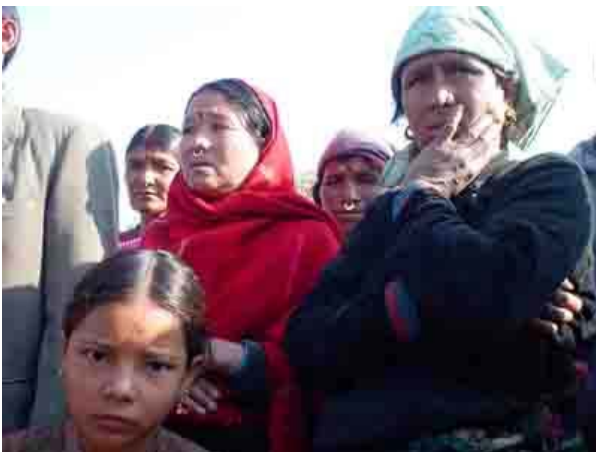
Families continue to be impacted in all aspects of their lives and don't know where to go

This project is the first one of this kind in Nepal. Its innovative approach is to include not only displaced children, which would be a matter of discrimination, but to include all children who are affected by the armed conflict, impoverished and struggling for their survival. Terre des hommes with its local partner organization will provide immediate assistance to these children and their families in the field of education, psychosocial support (mainly in the field of recreation & play) and nutrition for small children. There will be an organized effort to identify and document these displaced children, and to enlist the support of government ministries to provide for their basic needs.