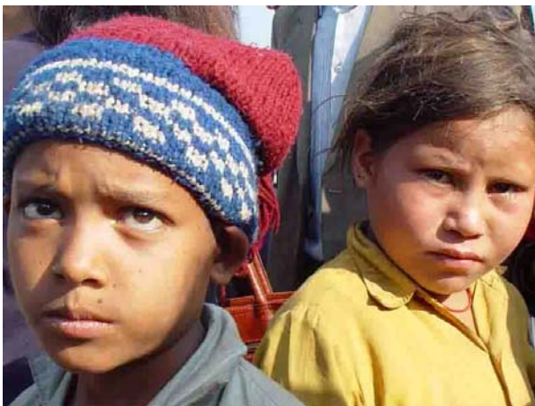
Displaced children in a camp near to Nepalganj, Midwestern Nepal – close to the Indian border

The children of Nepal are particularly vulnerable. Since the end of the cease-fire agreement in 2003, violations against Nepali children have been steadily increasing by both parties to the conflict. The armed conflict has weakened fragile gains in literacy, child mortality, nutrition and other areas, as the general standard of living and quality of life for all Nepali children continues to deteriorate. Many children in Nepal are growing up in an environment shaped by the violent conflict. They are confronted by guns, bombs, bandhs (strikes), killings, the sight of dead bodies, have witnessed others being tortured or killed, their parents being threatened and developed a fear of war with all its psychological and social consequences. They worry about losing their homes, their families and their education.