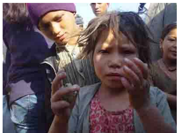
Near to Nepalganj the first refugee camps of IDPs are already setup with 476 displaced children

Among them were many who have been encouraged to go to school for the first time, while wealthier families have been able to transfer their children to private schools in the safe urban areas. According to a UN study the country has one of the highest school dropout rates in the world. Among the consequences of the conflict has been internal displacement of families, a general sense of insecurity and a generation of children growing up in a culture of terror.