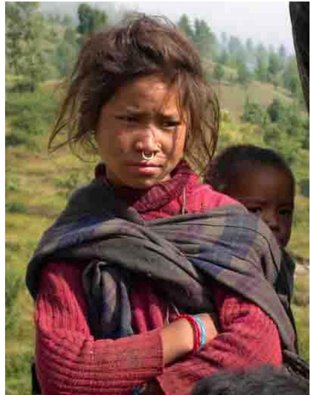
A girl child with her younger brother in Mugu