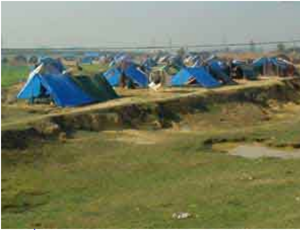
On 4 th of May 2005 Tdh counted 216 families with 578 men and 519 women including 476 children in Rahjena Camp near to Nepalganj.

There are also reports coming in which show that in recent years children have begun to migrate by themselves inside the country. They have experienced tremendous loss both in terms of physical wealth and emotional attachments to their people and localities – experiencing a sense of despair, disorder and insecurity.