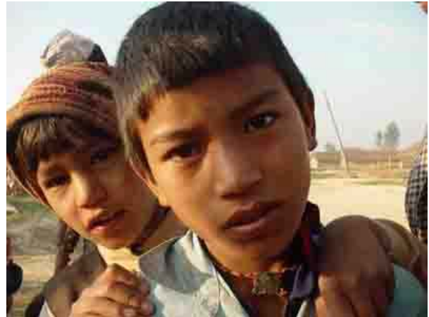
799 displaced children were found in nearby communities and villages. Most stay with their relatives or friends in rented houses, in cow sheds or other poor facilities.

mechanism fails, these children will be pushed out of these communities, they try to settle in. They are in urgent need of protection and support.